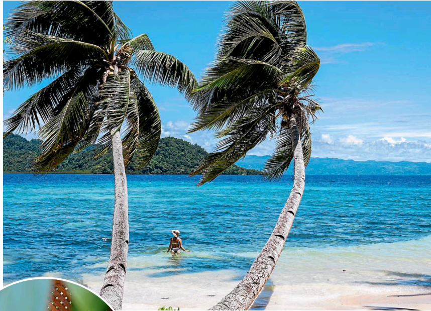
With just 12 rooms, Matangi Private Island Resort is never crowded.

You can kayak and paddleboard, but the standout highlight is the overwater spa, where you