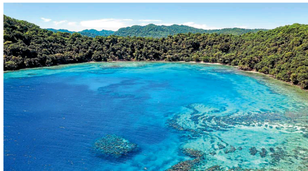
The island is famous for Horseshoe Bay.