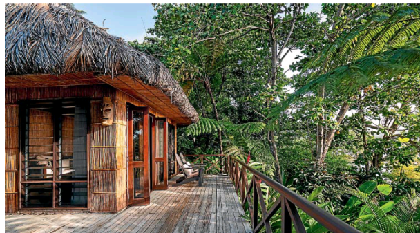
The tree house is the most luxurious option on the island.

Don't make the mistake we did and only stay for